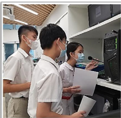
PA broadcast by our PA Team

This is an elitist writing team reporting campus news and introducing fun facts about English and reviewing different aspects of popular culture.