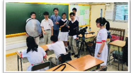
Precious moments of our Campus TV Productions