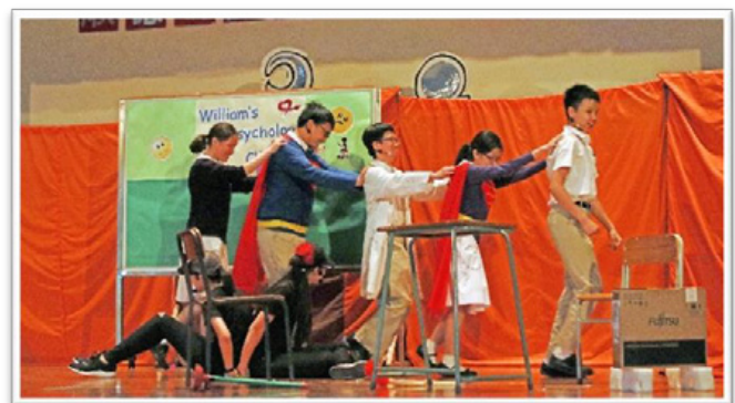
Funny episodes of our S1 Drama