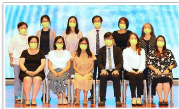
Teachers of English Language Education KLA

The English Language Education Key Learning Area (KLA) is an integral part of the school curriculum. The English Department provides students with a wide range of interactive and communicative learning experiences to enhance their English language proficiency, social skills, cultural understanding, global competitiveness, as well as personal and intellectual development.