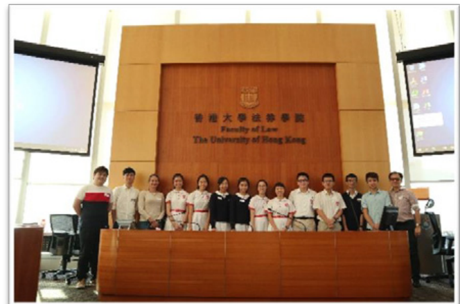
'Street Law Programme' at Faculty of Law, University of Hong Kong