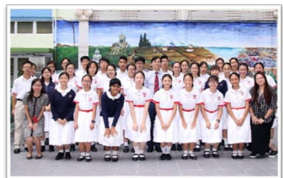
What's UP? Team members 2019-20