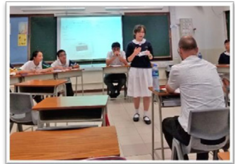
Our school's Junior English Debating Team