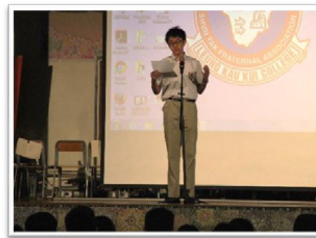
English Public Speaking Team winners