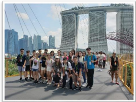
Summer Exchange Tour to Singapore 2019