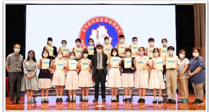
Speech Festival winners 2020-21

Our students have been actively participating in the festival, from solo to group competitions and from verse, prose, to public speaking, choral speaking and drama categories.