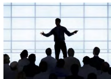
Public Speaking Team

We are back with a brand new team! Besides promoting the use of English in school, we hope to see more of you enjoying reading in English, so please enjoy this first issue of the year! Happy reading!