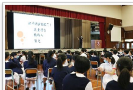
Talk on volunteer work