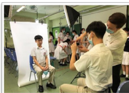
Students taking photo for interview