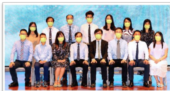
Teachers of Other Learning Experiences

Under the Senior Secondary Curriculum, Other Learning Experiences (OLE) is one of the three components that complement the core and elective subjects for the whole-person development of students. Building on the foundation of the essential learning experiences in the Basic Education, our school offers students a range of OLE opportunities encouraging them to participate in the five areas of OLE, namely Moral and Civic Education, Community Service, Career-related Experiences, Aesthetic Development and Physical Development.