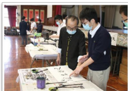
Students practicing Chinese calligraphy