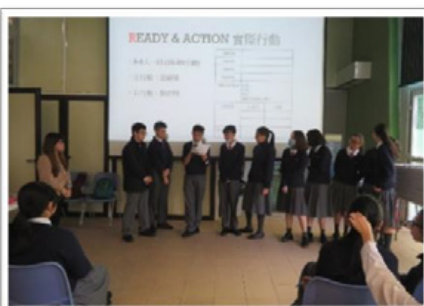
Attending a talk on community service