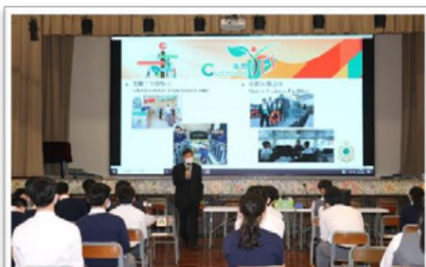
Talk by the Customs and Excise Department

Our school will continue to facilitate students to deepen and consolidate their own learning through quality reflection so as to nurture students' life-long learning capability and foster their whole-person development.